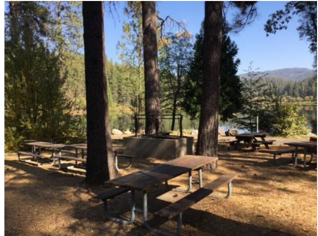
White Pines BBQ and Picnic Area

For other outings planned for this season, take a look at the events page . If you have interest in a particular outing, please contact me.