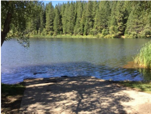
White Pines Launch Ramp

ones, and maybe find a new buddy to fish with. And maybe at the end of the day stop in Arnold for a nice dinner. I hope to see you there!