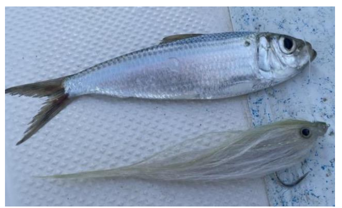
This year's menu