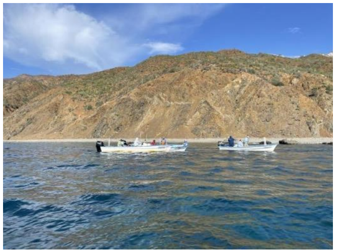
Getting bait at Isla Cerralvo