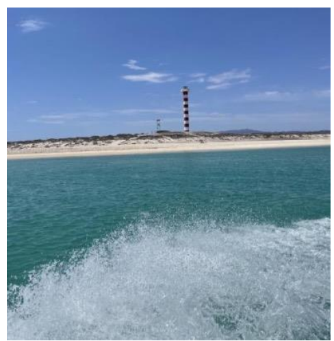
The famous lighthouse at Punta Arena de La Ventana