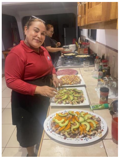
The ladies preparing another feast