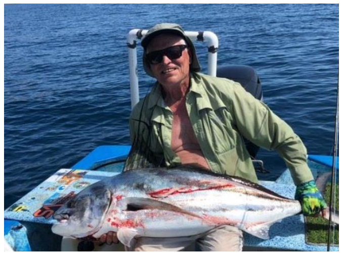
Jim's Nice Rooster (they were able to revive and release this fish)