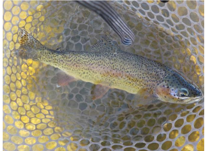
A rainbow from the Madison River near $3 Bridge in Montana.

Just a reminder that on October 3 rd , there will be a Bamboo Rod and Casting Clinic , which will be held at Wattenburger Park from 2:00 pm to 4:30 pm. There is a link to a Google map if you don't know where the park is. If my memory serves me right, I caught my first trout on my father's old bamboo fly rod. I remember this because I broke the tip on his rod. Thankfully, the rod came with an extra tip. This all happened back in the 50's, and the rod hasn't been used since my dad passed