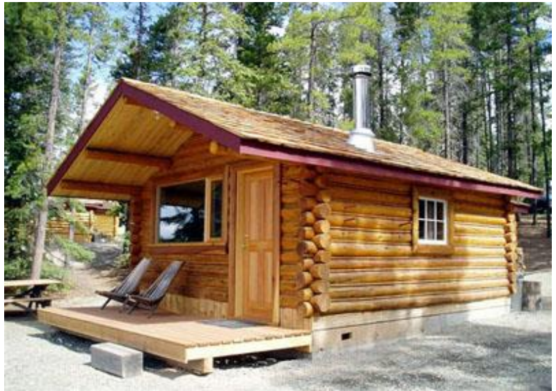
Private log cabins on Nimpo Lake with hot showers, toilets, two double beds, linens, daily maid service and three meals a day.