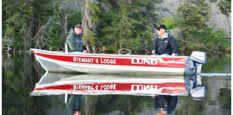
The lodge provides 12 to 14 foot boats with 3hp to 8hp motors.