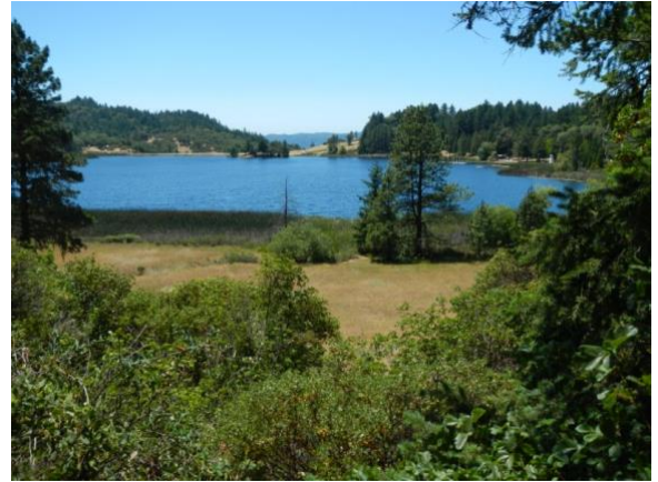
Private lake full of BIG BASS.

Since 2014 we have helped the BSA put on a Fly Fishing Merit Badge program at their Wente Scout Reservation Summer Camp located in Willits, CA.