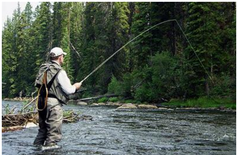
Fish cleaning, smoking and vacuum packing services available.