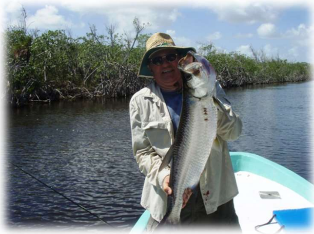
20 # Tarpon

For more information or to reserve your spot contact Martin Plotkin.