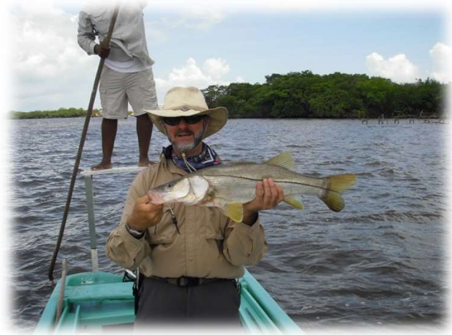
Good Size Snook

The cost of the trip is $2300/angler and includes 6 days guided fishing or sightseeing. The second group can choose between spending 3 days fishing from the