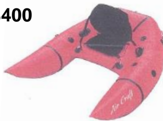
Dave Scadden's Air Craft

Dave Scadden's Air Craft sets a whole new level of high performance float tube technology. Weighing in with an unbelievable hull weight of 3lbs 6 oz. the Air Craft is the lightest float tube in the world. It is no cheap blow up toy. The Air Craft boasts Dave's exclusive fully rockered hull design, 700 lb. weight capacity, class IV whitewater rating and lifetime warranty. The Air Craft utilizes multiple layers of urethane coatings both inside and out for unparalleled durability. Combine this with some of the most sophisticated radio frequency heat welding technologies in the world and you have a tube that is not only lightweight but extremely user friendly. The Air Craft is a joy to move around both in and out of the water but most of all it is a blast to fish from. It is like you are fishing on a cloud... You are!