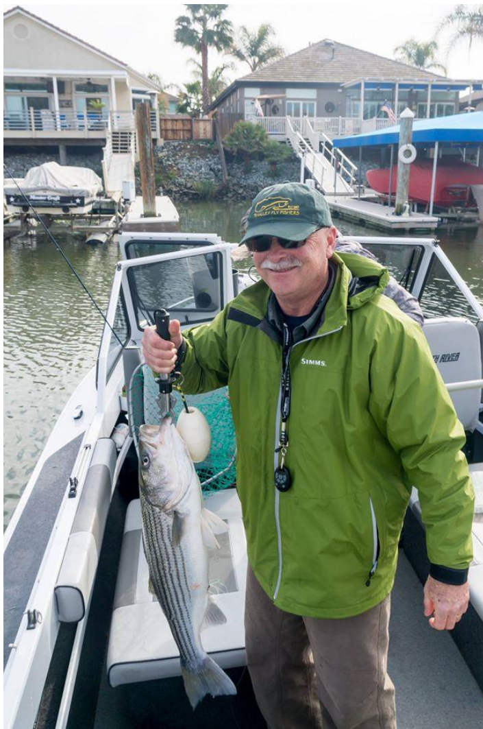
12 pound Delta striper from 2015. These fish are great fun on a fly rod.

We will provide more information as we get closer to the outing and we can get more specific as the stripers keep moving in, which usually starts around mid to late October. It is looking like a good season this year with lots of early stripers being caught out in the Western Delta!