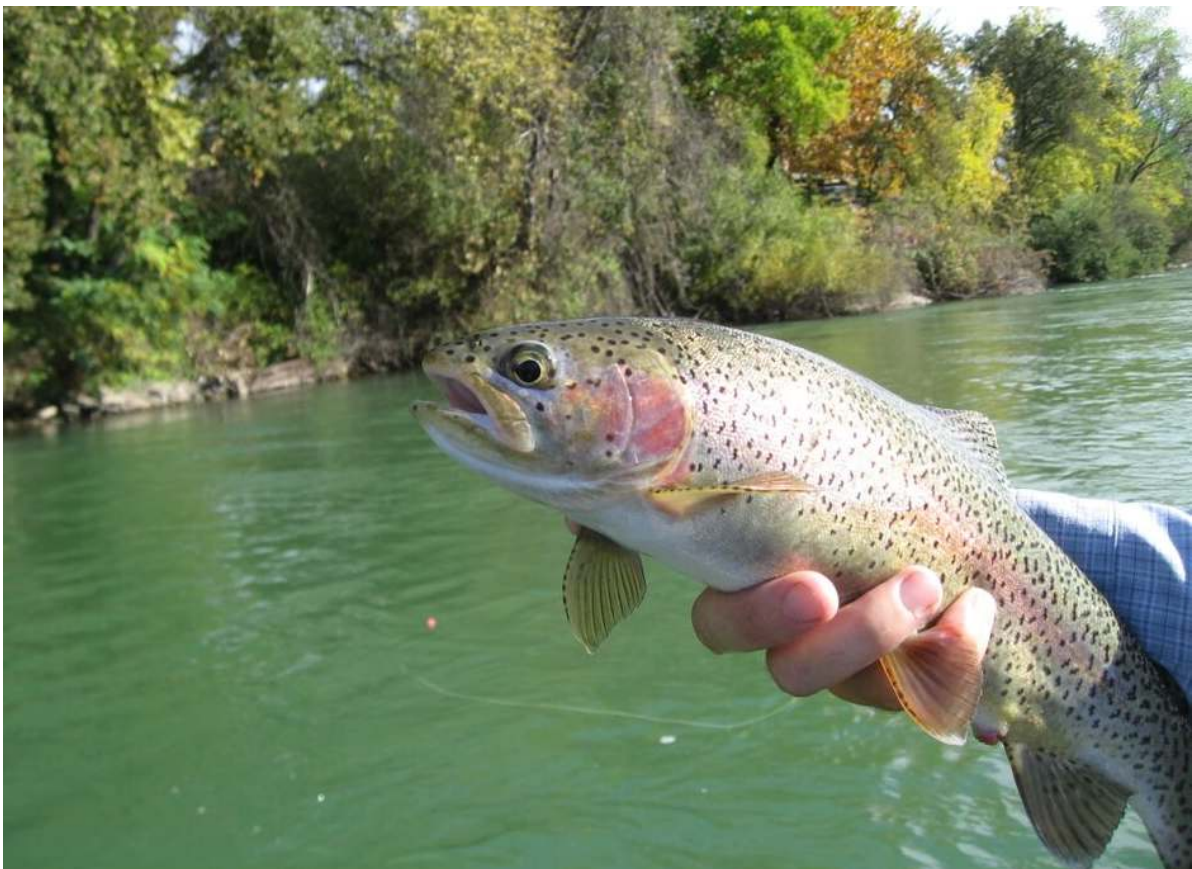
“Lower Sac” Rainbow Trout

Sign up sheets will be out at our next TVFF meeting, January 7th.