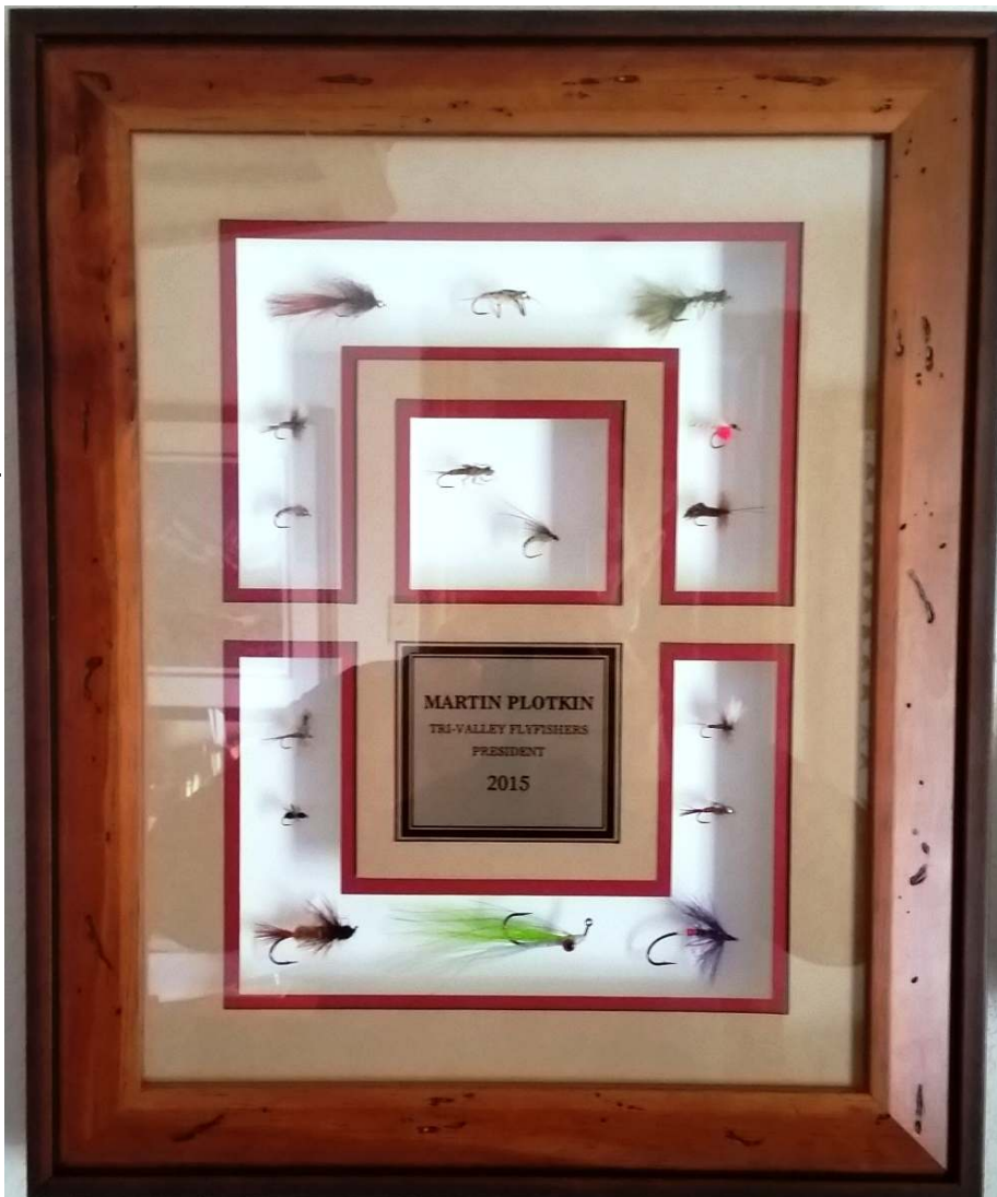
Martin's presidential fly plate.