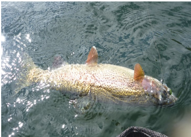
A fat 20-inch Goodwin Lake rainbow trout.