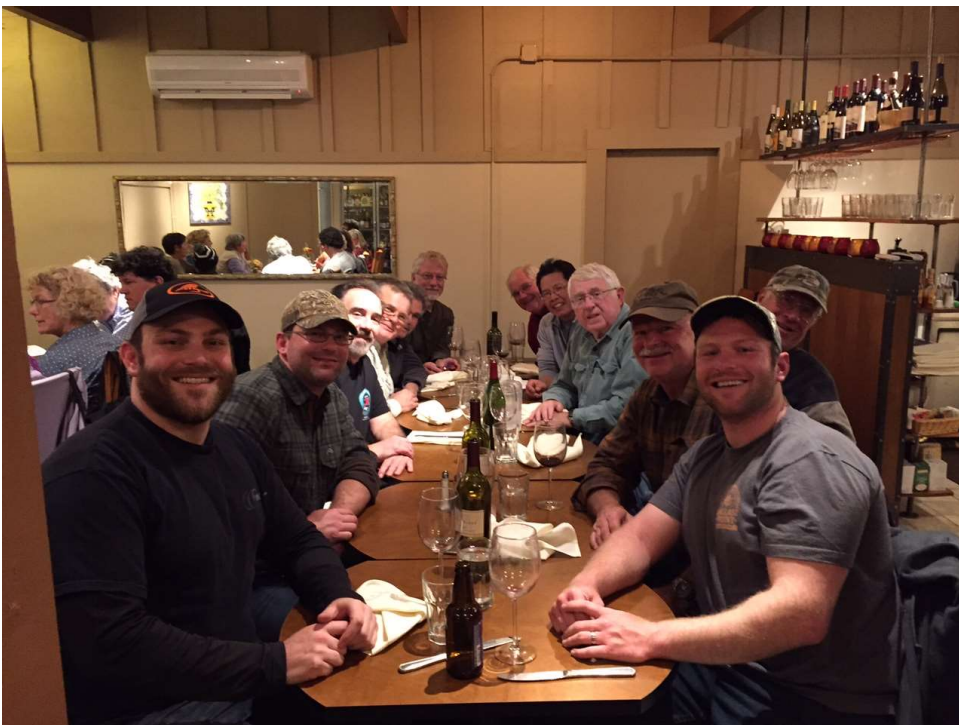
Group Dinner at the Indian Creek Lodge Restaurant, Douglas City