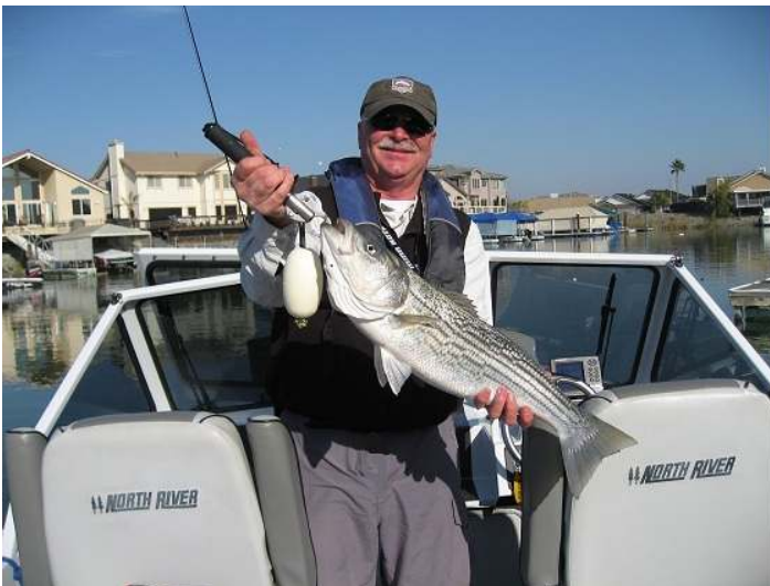
10 pound Delta striper from 2012. These fish are great fun on a fly rod.

Equipment: 8, 9 or 10 wt. rods with Hi-Speed / High Density shooting heads. Lead core heads, Teeny 300-400, Rio Outbound or SA Custom Tip Express lines trimmed to match the rod all work well. The integrated style lines are easier to cast than lead core. Your leader is simply 5-6 ft of 15 - 20 lb mono (Maxima). Flies that simulate baitfish patterns such as 3-5 inch Clouser minnows, Flashtail Whistlers, Deceivers, etc. work well. The 2/0 chartreuse and white Clouser is a standard. Take a look at past newsletters for December and January of '11 and '12 for what has been successful. We will provide more information as we get closer to the outing and we can get more specific as the stripers keep move in, which usually starts around mid to late October. It is looking like a good season this year with lots of bait already arriving and being chased by hungry stripers!